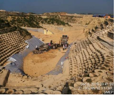
Sanitary landfill Camp 20Ext.