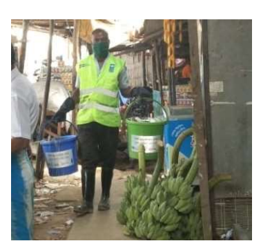
CfW collecting waste from markets.

about current community practises on SWM which has helped to develop the key contents of the 3Rs